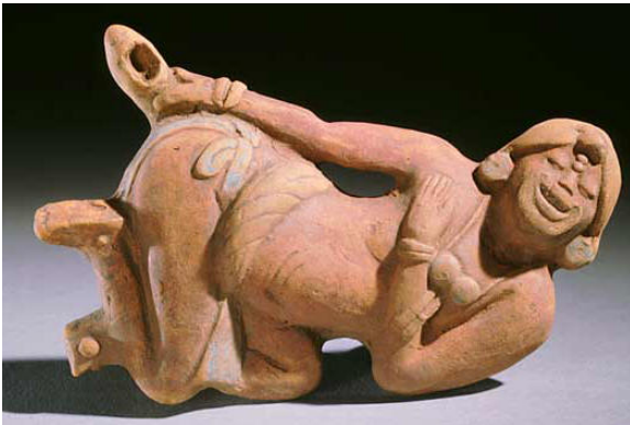
Guatemala Escuintla Maya culture, Escuintla, Middle-Late Classic periods, A.D. 400-850

In the New World another system of administering a honey based drug was used particularly by the Maya. Archeologists excavating Mayan tombs turned up tubes (of rubber?) whose function was unclear. Paintings found on a number of vases illustrate in detail the use of these tubes. One illustration shows a recumbent figure with his legs spread. He is receiving an enema which is being administered by a person (woman?) standing beside him holding a container connected to a tube. There is also another male ladling enema fluid out of a large jar. Another painting of this kind shows an attractive young woman (goddess?) removing the clothing from a to a male (god?). In front of her are the enema container and what looks like a rubber enema bulb syringe. Besides paintings there is even statuary with the same theme.